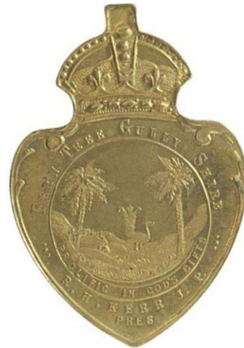
Circa 1902: Ferntree Gully Shire, Edward VII's Coronation Medal