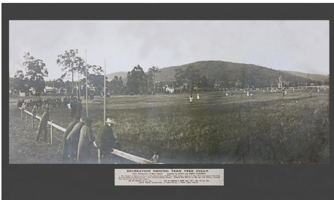
Circa 1912: The official Shire photograph (now owned by the Club) of the Ferntree Gully Recreation Reserve, which was dedicated on 25/5/1912 and opened 17 years after it was first proposed by the Shire in 1895!