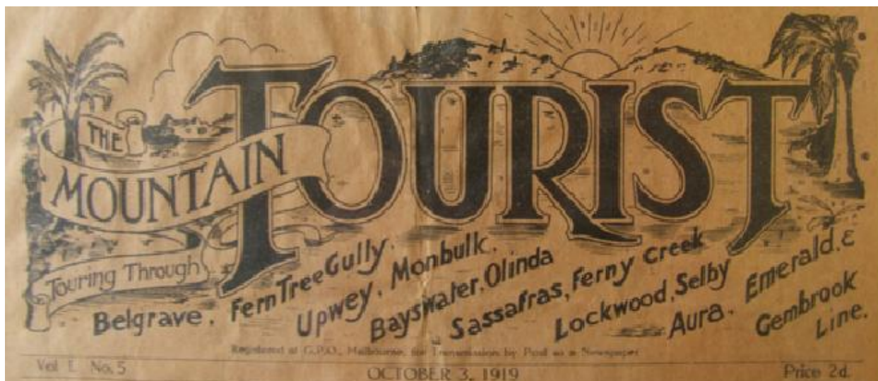
1919: The Mountain Tourist masthead, the first newspaper of the Dandenong Ranges (only a handful of copies known to exist) & the first promoter of competition cricket in the Dandenongs