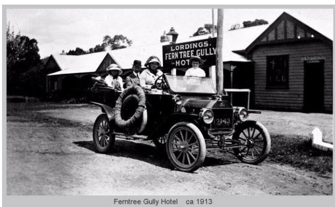
Ferntree Gully Hotel ca 1913