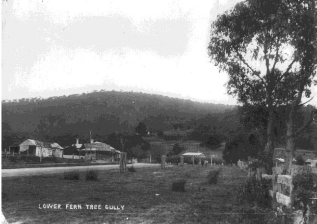
Circa 1905: Looking along Main Road (Now Burwood Highway) with Lording's Store in the centre