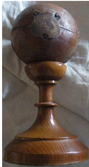
1937: Wal Tew – 11/64 in the 1936/37 Grand Final – Despite this effort we lost!