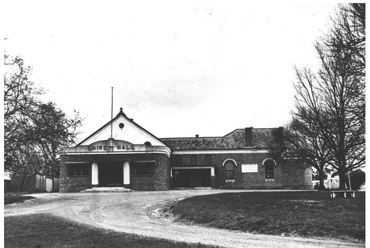
Circa 1930's: The Ferntree Gully Shire Hall – Opened 1889 & scene of many Club functions for the next 70 years