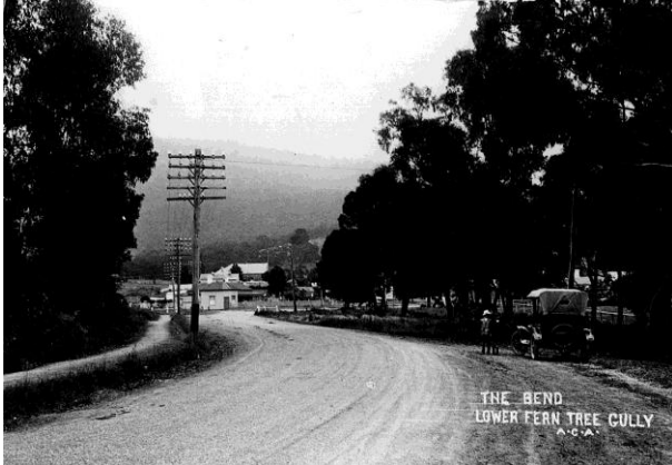
Circa 1925: The bend into Ferntree Gully, with the original Police Station (cnr. Station Street & Burwood Hwy.) in the photograph centre

The following images are of the Club, its people and the places of interest and influence on the Inter War era in the Dandenong Ranges, Ferntree Gully and the Cricket Club. We always welcome others that identify with our origins and are more than happy to scan, copy, process and return originals.