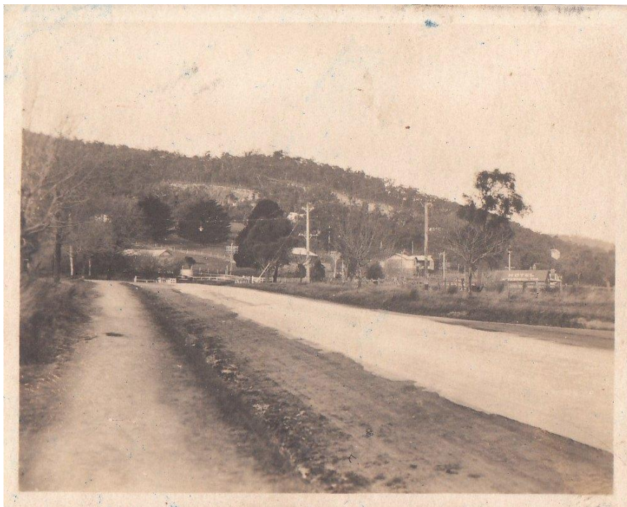
Circa 1930: Main Road (Burwood Highway) – No Shops, no Woolworths (Safeway), no Le Pine Funeral Parlour, no Car Yards and no Lording's Store but the ubiquitous Ferntree Gully Hotel is present – 70+ years after it opened!