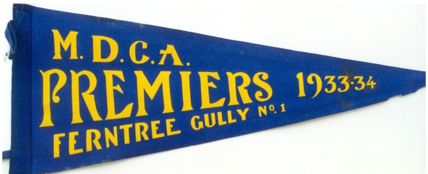
1934: The first of 20 1 st XI Premierships – the original Pennant, still in the possession of the Club, has now been restored & returned to its former glory