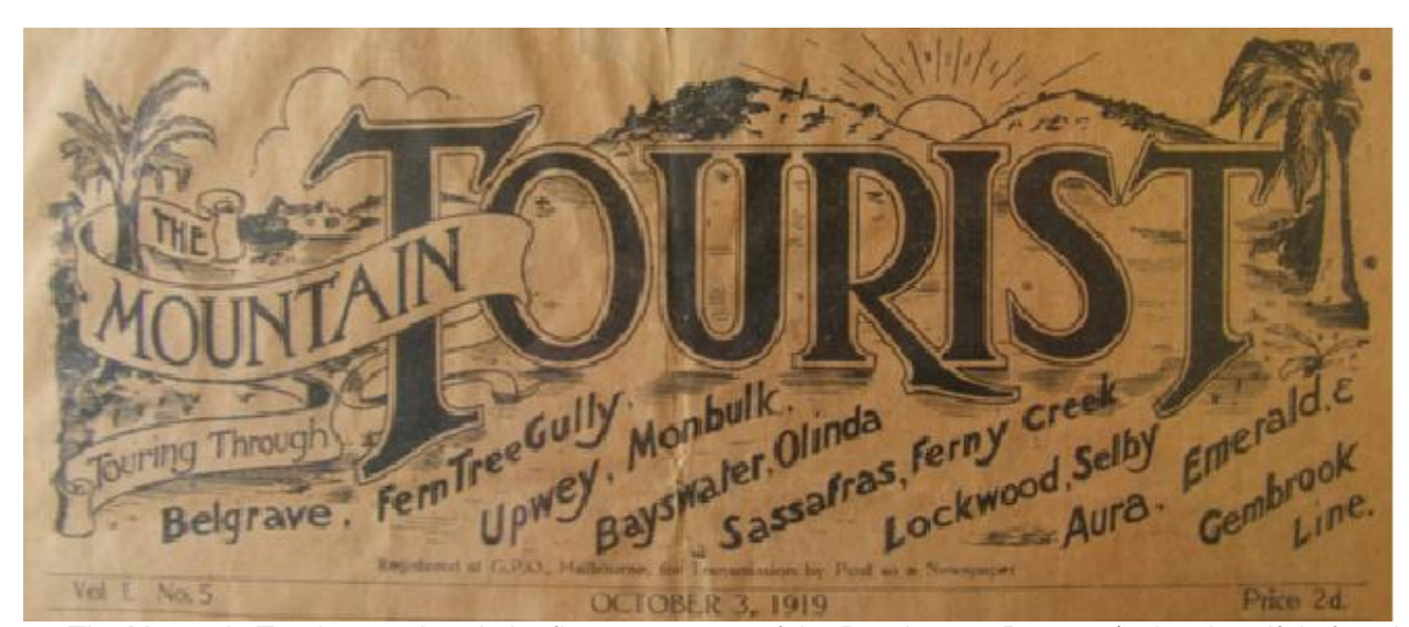
1919: The Mountain Tourist masthead, the first newspaper of the Dandenong Ranges (only a handful of copies known to exist) & the first promoter of competition cricket in the Dandenongs